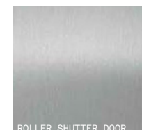
ROLLER SHUTTER DOOR